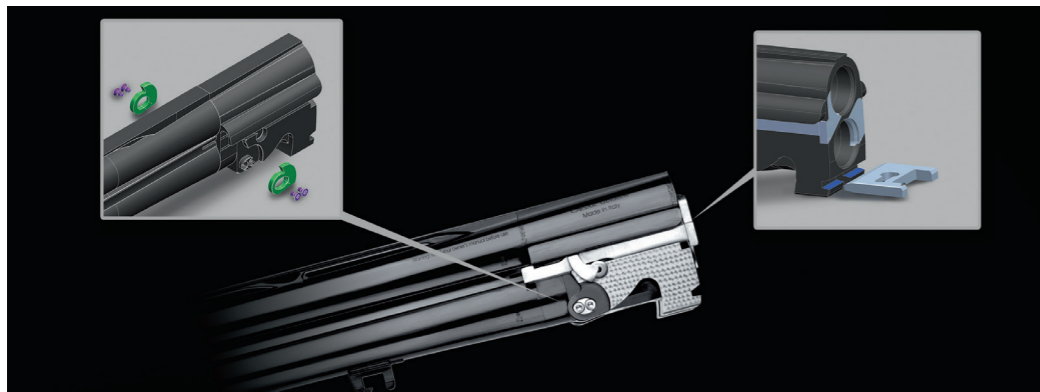
THE INVICTUS CAMS ELIMINATE CONVENTIONAL HINGE PINS AND TRUNNIONS. THIS SYSTEM MAKES THE INVICTUS THE FIRST DOUBLE GUN THAT CAN MOVE THE RELATIONSHIP OF THE BARRELS TO THE ACTION. THIS ALLOWS THE BARRELS TO BE MOVED REARWARD TO ELIMINATE ANY POTENTIAL 'OFF FACE' CONDITION.