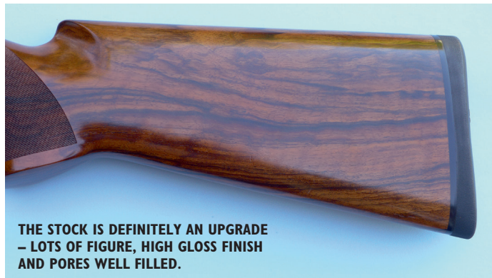
THE STOCK IS DEFINITELY AN UPGRADE – LOTS OF FIGURE, HIGH GLOSS FINISH AND PORES WELL FILLED.

Considering the side plates, the intensive engraving, the wood upgrade, the quality checkering, the replaceable Invictus Block and the gun’s durability, there’s a heck of a lot of value in this gun at $8795. Invictus is a Latin word meaning ‘invincible’ – this shotgun is aptly named. ■