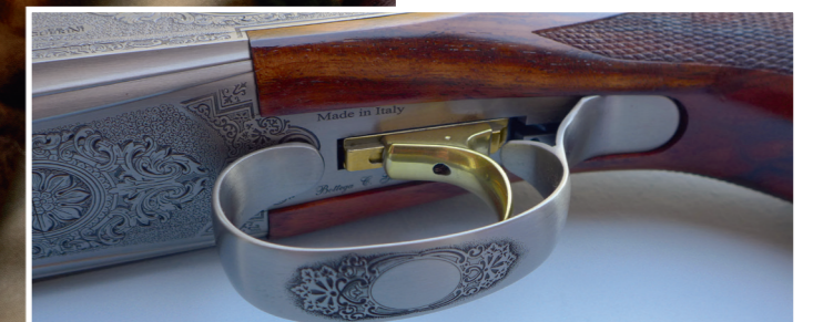
THE GOLD-PLATED TRIGGER CAN BE MOVED BACK AND FORTH TO ATTAIN PERFECT GRIP-TO-TRIGGER DISTANCE.

The Invictus V incorporates a new trigger system, named the DPS2. I found it extremely light, and so did others I had shoot the gun. There's also a crispness and speed that competition shooters will love. On my Lyman Digital Trigger-Pull Scale the trigger went