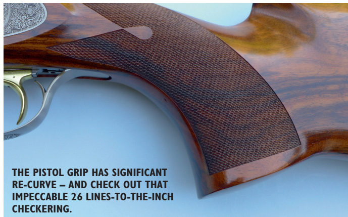
THE PISTOL GRIP HAS SIGNIFICANT RE-CURVE – AND CHECK OUT THAT IMPECCABLE 26 LINES-TO-THE-INCH CHECKERING.