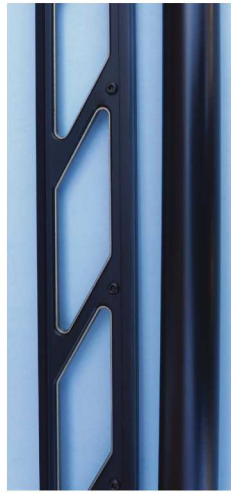
BRIGHT ALUMINUM ALLOY ON THE INTER RIB OF THE INVICTUS V UNSINGLE BARREL.

Guerini calls their Invictus chokes 'Maxis Competition'. They are long at 3 1/4 inches – providing plenty of room for extended taper and parallel sections. Five chokes were provided at .720 (all three barrels measured .731 internally). Modified at .715. Improved Modified at .710. Light Full at .705 and Full at .700 – all measurements accomplished with my Baker Barrel Reader.