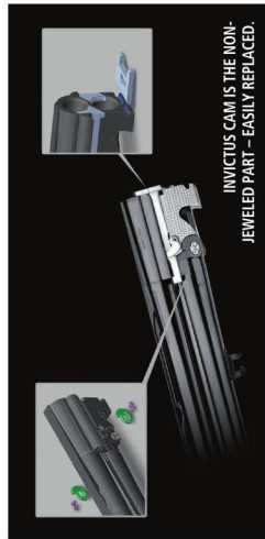
INVICTUS CAM IS THE NON-JEWELLED PART – EASILY REPLACED.