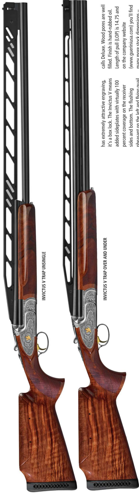
INVICTUS V TRAP UNSINGLE