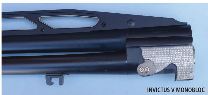
INVICTUS V MONOBLOC