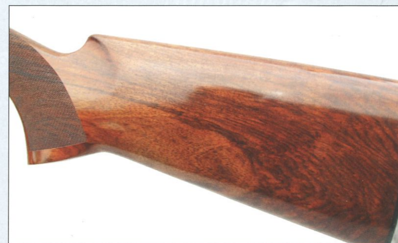
The Invictus VII looks good, but it's not just a pretty receiver plate and well-figured woodwork; the internals are something special too

“The pulls are the lightest of any off-the-shelf gun I have ever tested”