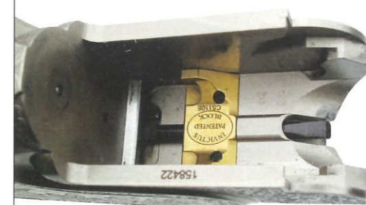
The patented locking system gives good structural strength and contributes to the gun's durability

The locking lugs can also be replaced should any wear develop. The bifurcated bottom lugs are machined into the rear underside of the barrel monobloc and sit down into the receiver floor against a full width buttress. Many guns have a similar robust locking arrangement, which is combined with a