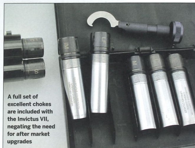
A full set of excellent chokes are included with the Invictus VII, negating the need for after market upgrades

glossy, with no ripples or imperfections – a sign of attentive hand finishing.