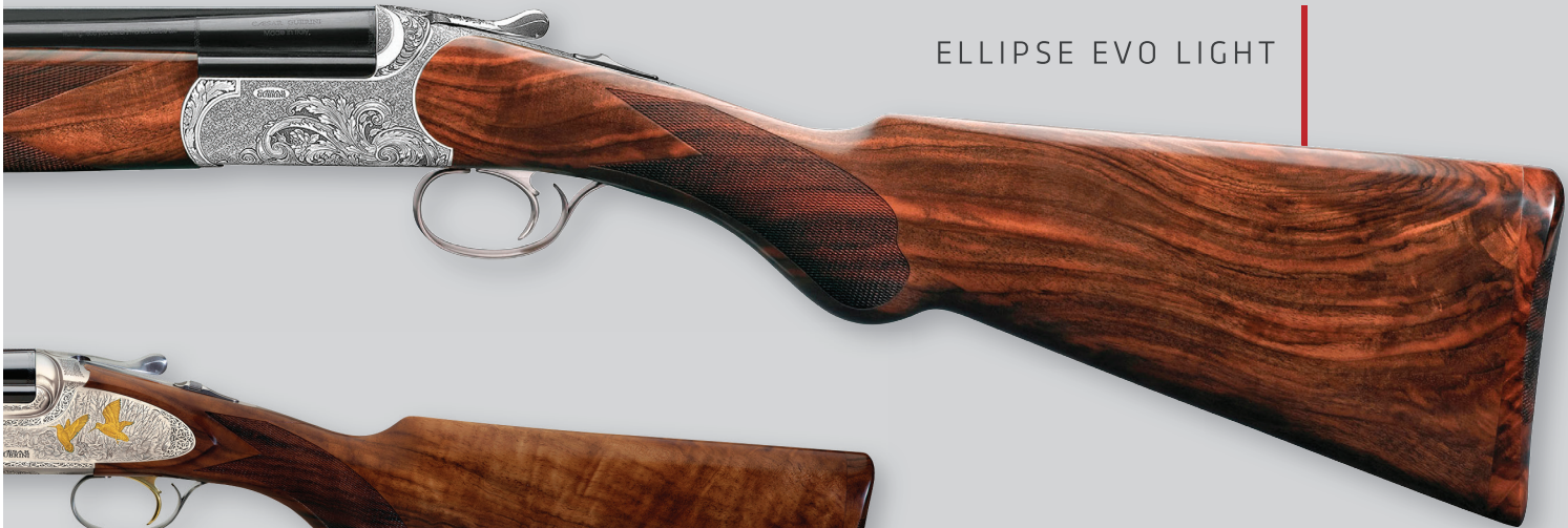
ELLIPSE EVO LIGHT